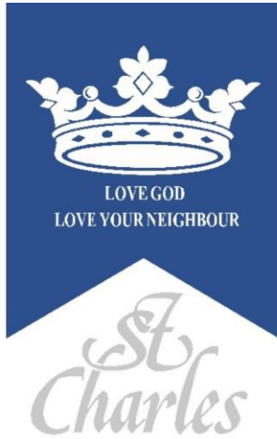
St Charles Catholic Primary School Love God, Love Thy Neighbour