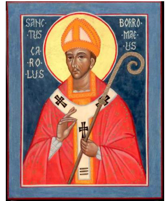
St Charles Borromeo

We are here to educate the children in a community which has the Gospel values, traditions and beliefs of the Catholic Faith at the centre of its ethos.